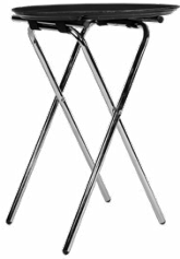
Chrome tray jack 4.20 Black waiter tray (27") 3.00