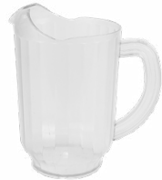
Plastic pitcher 2.50