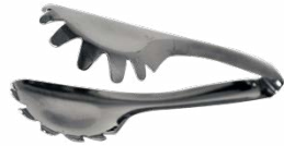
Highland pasta serving tong 5.50