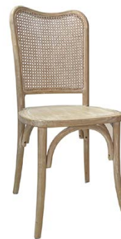
Celine stonewash rattan chair (includes cushion) 15.00