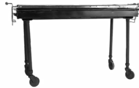
Big John charcoal grill (2x5) 65.00