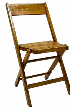
Rustic wooden stain 3.50