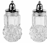
Salt and pepper (cut glass, not filled) 2.00