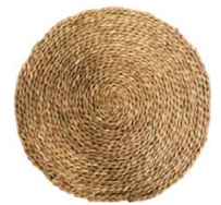
Ameila Seagrass Placemat