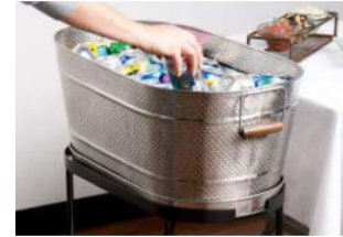
12 Gal. beverage tub 18.00 Stand not included