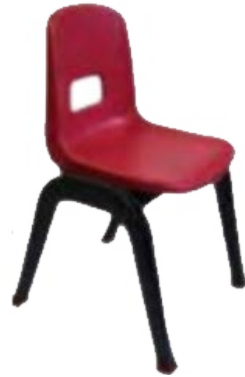
Red juvenile kids chair 5.50