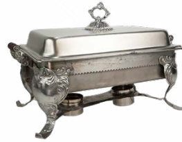
Oblong ornate chafer 25.00