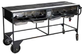
Propane grill (2x6) 175.00 burns approx. 8 lbs propane/hr *Propane sold separately