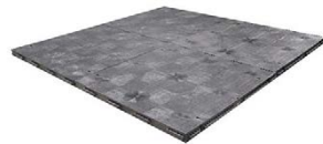
Duratrac Flooring 4' x 4' section 38.00