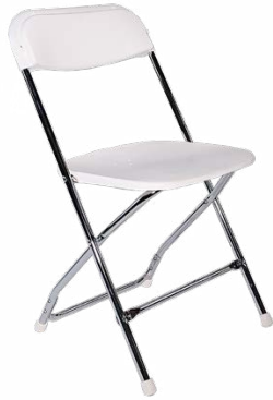
White polyfold with chrome leg 2.50