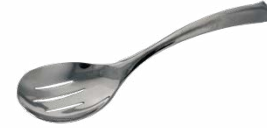
Highland serving spoon (slotted) 5.50