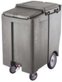
Cambro mobile caddy ice chest 85.00