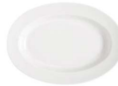
Milano Oval Platter (17" x 12" with lip) 9.00