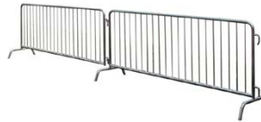
Galvanized fence (8' x 3'86") 28.00