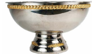
100 Cup gold trim punch bowl 23.00