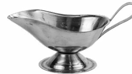
Gravy boat (stainless steel) 1.50