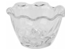
Glass bowl sherbert 5 oz. .60 each