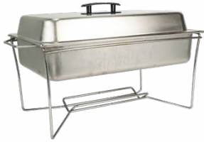
Wire chafer 14.00

Chafer rental includes: 1- frame, 1 lid, sterno cup holder(s), 1-water pan