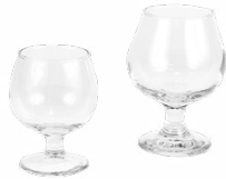
Brandy Stemware Brandy glass (3.5 oz) .60 Brandy glass (9 oz) .60