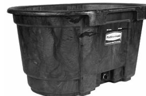
Rubbermaid horse trough 17.00