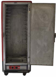
Electric hot box (small) 175.00