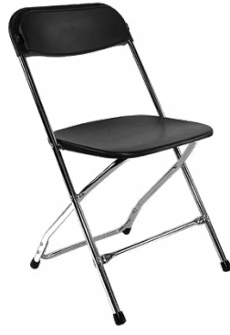
Black polyfold with chrome leg 2.50