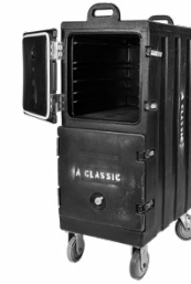
8 Pan cambro (on wheels) 30.00