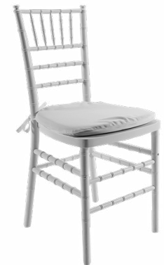
Silver Chiavari (includes cushion) 10.25