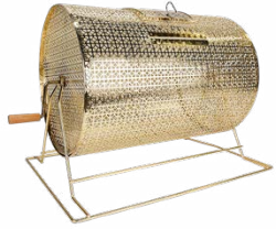
Raffle drum 14" Diameter, 20" Long. 17.00 Must return box or $10 fee will apply.