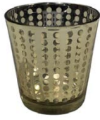
Gold polka dot votive cup (small 2.25" x 2.5") 3.00