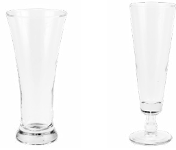
Pilsner (flared or footed) (12 oz) .70