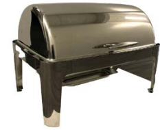
Stainless steel roll top chafer 45.00