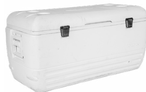
White large ice chest cooler 17.00