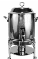
Deco coffee urn 3 gallons 45.00