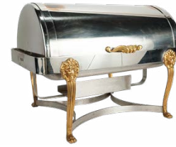
Brass roll top chafer 50.00