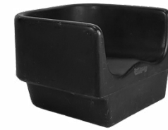
Booster seat 4.00