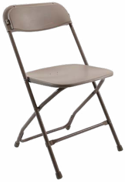
Bone polyfold with bone metal leg 2.00