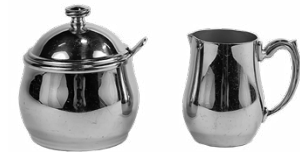
Sugar/Creamer (stainless steel) 2.75