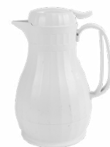
White thermal coffee servers 2.50