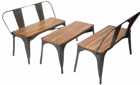
Gunmetal bench 45.00 Gunmetal stool/table 40.00