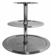
Three Tier Tray Height: 20" Top diameter: 11 3/4" Middle diameter: 13 3/4" Bottom diameter: 15 3/4" 25.00