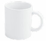
White Coffee Mugs (10 oz) .60