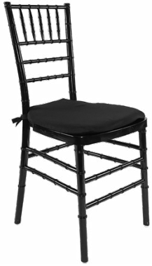
Black Chiavari (includes cushion) 10.25