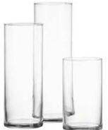
Glass cylinder vase (10" T x 4" W) 8.00