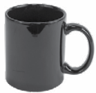
Black Coffee Mugs (10 oz) .60