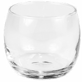
Roly Polly votive cup .75