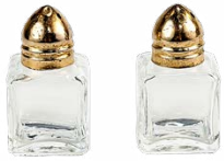
Salt and pepper (mini, not filled) 1.50