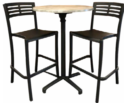
Patio Cocktail Table 20.00