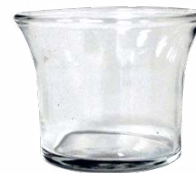
Glass bowl salsa cocktail 2 oz .60 each