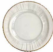
Gold Apollo Charger