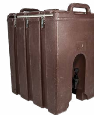
10 gal. Thermal beverage carrier 17.00