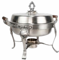
Round ornate chafer 20.00