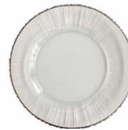
Silver Apollo Charger