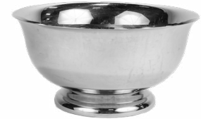
Revere bowl (8") 7.00 each