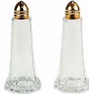
Salt and pepper (eiffel tower, not filled) 1.50