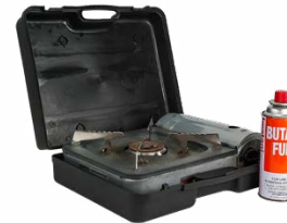
Table top butane stove 12.00 *Butane $5.00