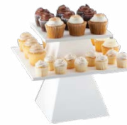
White Acrylic Stackable Trays White Acrylic Stackable Tray (9.5" x 9.5" x 4.5") 13.25 Milano Rectangular Platter (14.5" x 14.5" x 8") 17.25