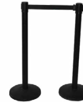
Retractable black stanchion 10' retractable 19.50