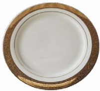
Gold Band Charger