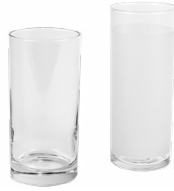
Highball Glasses Highball (10 oz) .60 Frosted highball (12 oz) .60