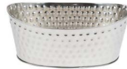
4 Gal. Bali oval tub 17.00