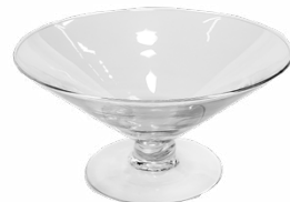
Fluted pedestal martini bowl 6.00