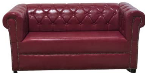
Bourbon Lounge Love Seat 230.00