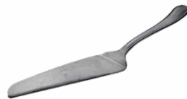
Pie server 2.75