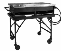
Propane grill (2x3) 90.00 burns approx. 4 lbs propane/hr *Propane sold separately