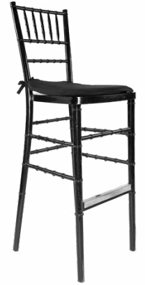
Black Chiavari bar stool (includes cushion) 25.00