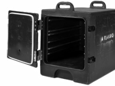
4 Pan cambro 17.00