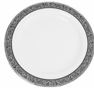
Silver Band Charger