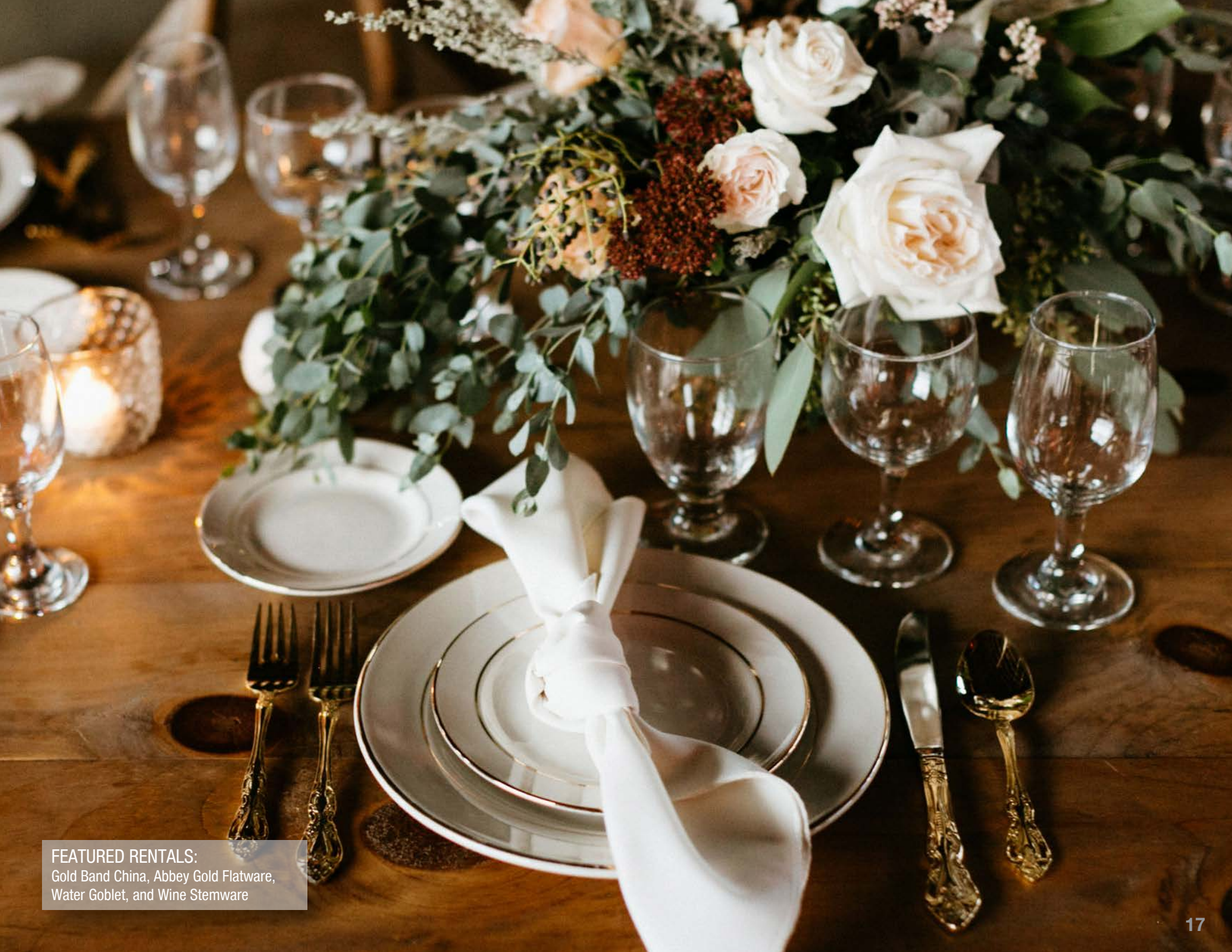
FEATURED RENTALS: Gold Band China, Abbey Gold Flatware, Water Goblet, and Wine Stemware