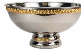
40 Cup gold trim punch bowl 17.00