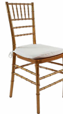
Gold Chiavari (includes cushion) 10.25