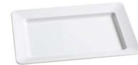
Milano Rectangular Platter Milano Rectangular Platter (8" x 15") 7.00 Milano Rectangular Platter (16.5" x 12") 11.50