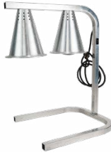
Heat lamp (table model w/o cutting board) 30.00