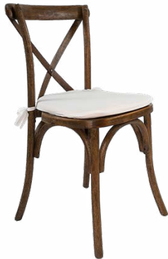
Vineyard crossback chair ($11.25 w/cushion) 10.25