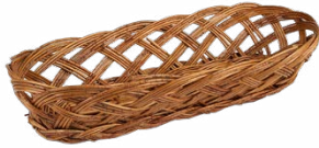
Bread basket (wicker) 1.50