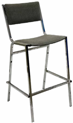
Charcoal cloth bar stool 30.00