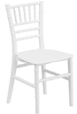
White Chiavari juvenile chair (no pad) 5.50