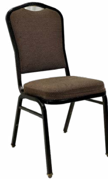
Ballroom stack chair - black pattern 4.50