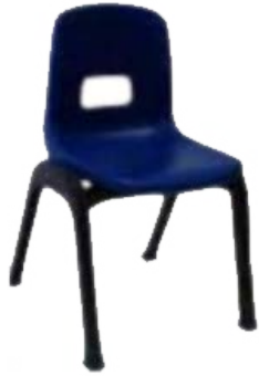
Blue juvenile kids chair 5.50