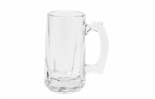
Beer Mug (9 oz) .60

NOTE: Glassware is rented in full racks (varies depending on glassware style)