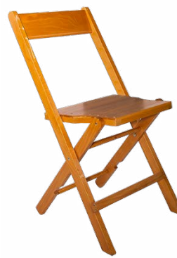
Wooden natural stain 3.50