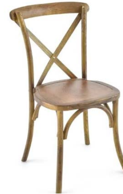
Crossback juvenile chair 8.00