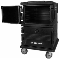
16 Pan cambro (on wheels) 35.00