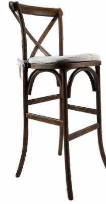
Vineyard crossback bar stool (includes cushion) 20.00