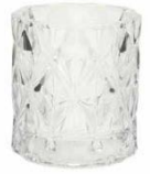
Clear Radiance Votive 3.00