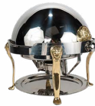
Brass round chafer (roll top) 40.00