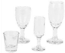
Whiskey Stemware Whiskey shot (1 oz) .60 Cordial (1.25 oz) .60 Whiskey sour (3.5 oz) .60