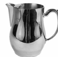
Silver water pitcher 9.00