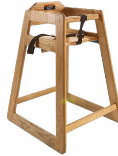
High chair 17.25