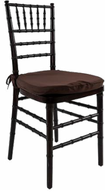
Mahogany Chiavari (includes cushion) 10.25