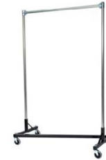
Coat rack heavy duty with wheels (noncollapsible, hangers rented separately) 35.00 Hangers - Bundle of 25 15.00