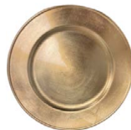
Gold Acrylic Charger With Lip