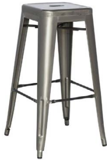
Gun metal bar stool (30") 10.00