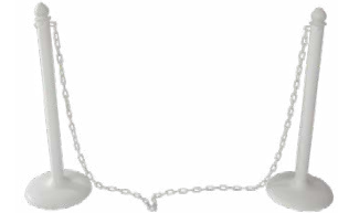
Plastic Chain and Stanchion White plastic chain (10') 3.50 White post 7.00