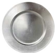
Silver Acrylic Charger