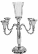
Silver 5 branch candelabra 12.00