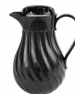
Black thermal coffee servers 2.50