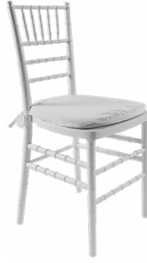
White Chiavari (includes cushion) 10.25