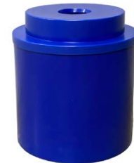
Super cooler (holds 144 cans) 35.00