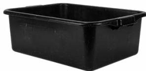
Bus tub 3.50