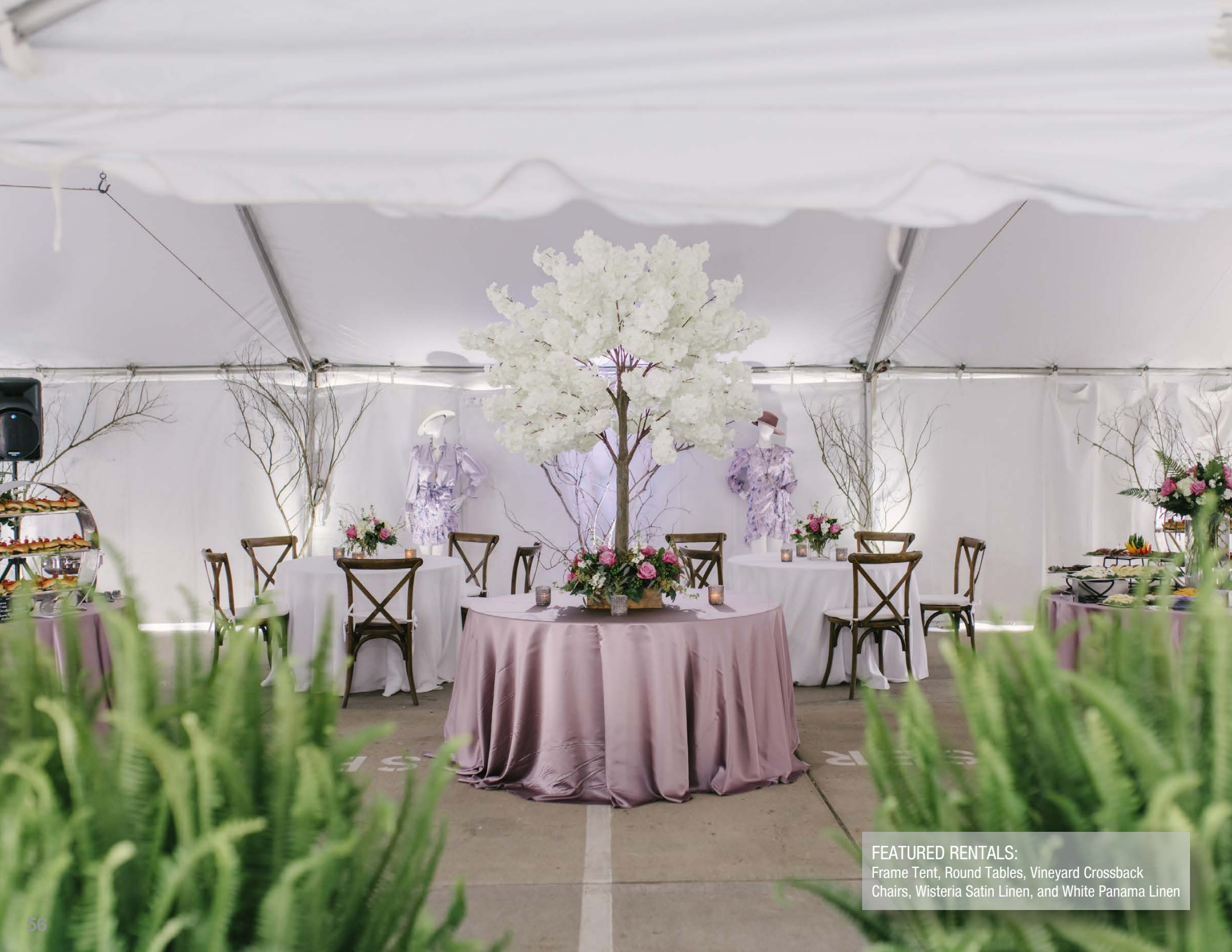
FEATURED RENTALS: Frame Tent, Round Tables, Vineyard Crossback Chairs, Wisteria Satin Linen, and White Panama Linen