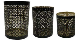
Black candle holders (set of 3) 17.50