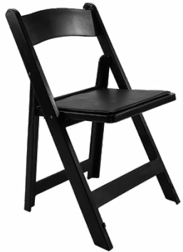
Black resin with pad 4.50