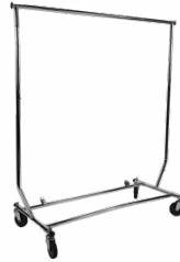
Coat rack folding with wheels (collapsible, 5' long, hangers rented separately) 20.00 Hangers - Bundle of 25 15.00