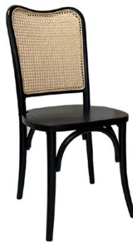
Celine black rattan chair (includes cushion) 15.00