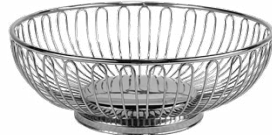
Round wire bread basket 7.00