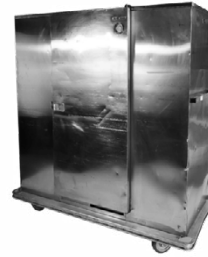
Electric hot box (large) 275.00