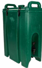
5 gal. Thermal beverage carrier 12.00