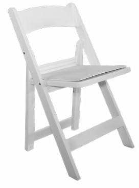
White resin with pad 4.50