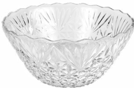
24 Cup glass punch bowl 14.00