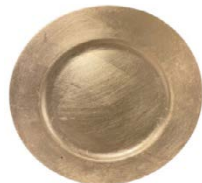
Gold Acrylic Charger