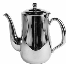
Silver coffee pitcher 9.00