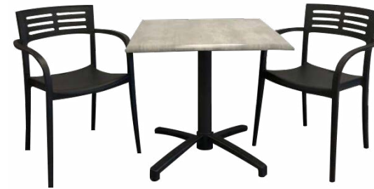
Patio Dining Table 20.00